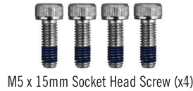
M5 x 15mm Socket Head Screw (x4)